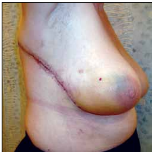
Photo of a patient 15 days post-surgery